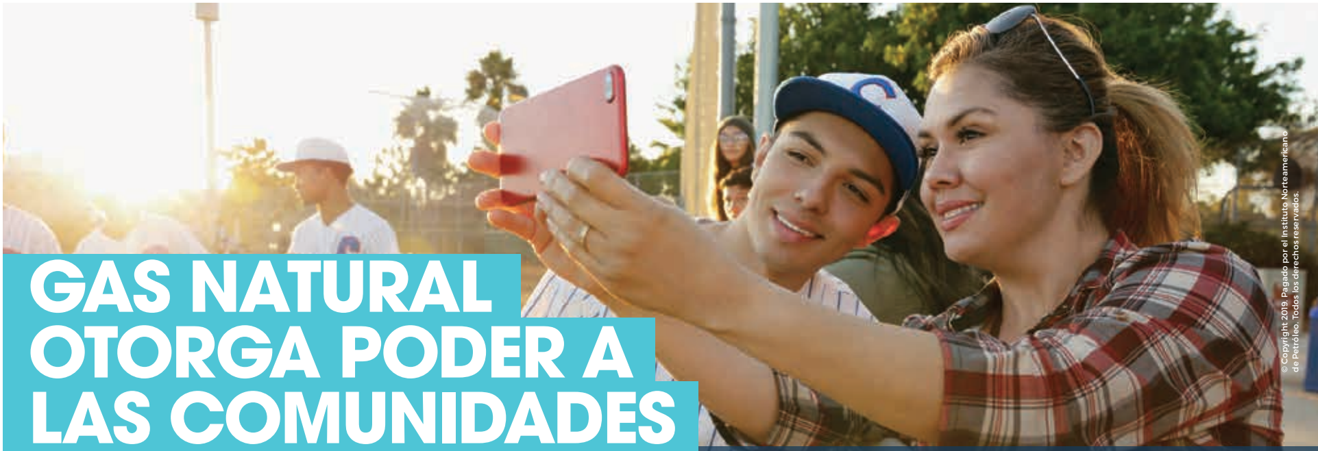
© Copyright 2019. Pagado por el Instituto Norteamericano de Petróleo. Todos los derechos reservados.